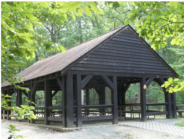
Telegraph Road Picnic Pavilion